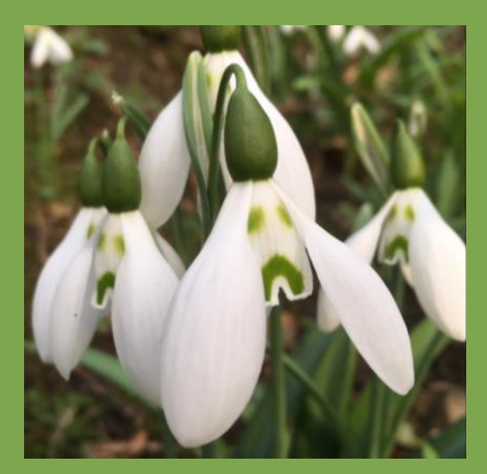
Galanthus elwesii 'Grumpy'