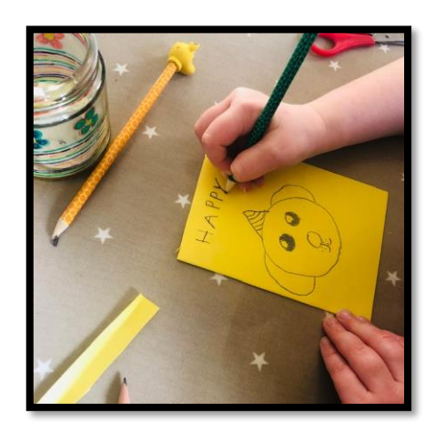
1. Fold your A5 card in half and draw a picture on paper back and forth, the outside if you want to.