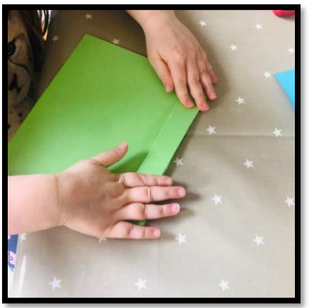
2. Fold the A4 green like you are making a fan.