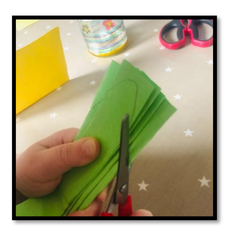
4. Cut away a curve at both ends.