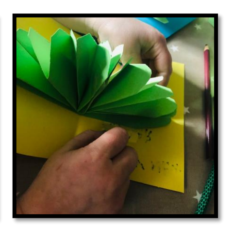
6. Stick this to the inside of your folded card, lining up the fold with the centre of the card.