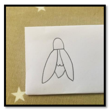
7. Draw a snowdrop flower shape on white paper and cut out lots of them.