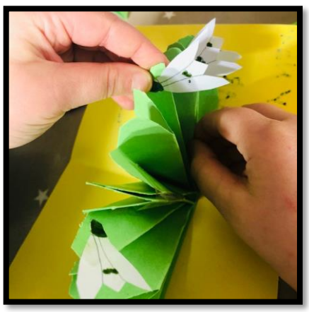
8. Colour a little bit of green on your snowdrop flowers and glue them to the pop-up.