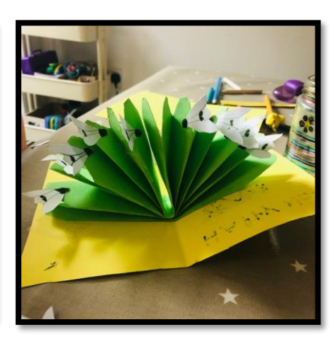
9. Hooray you've finished! Write in your card and give it to somebody special or put it on display.