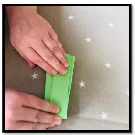
3. Fold this in half.